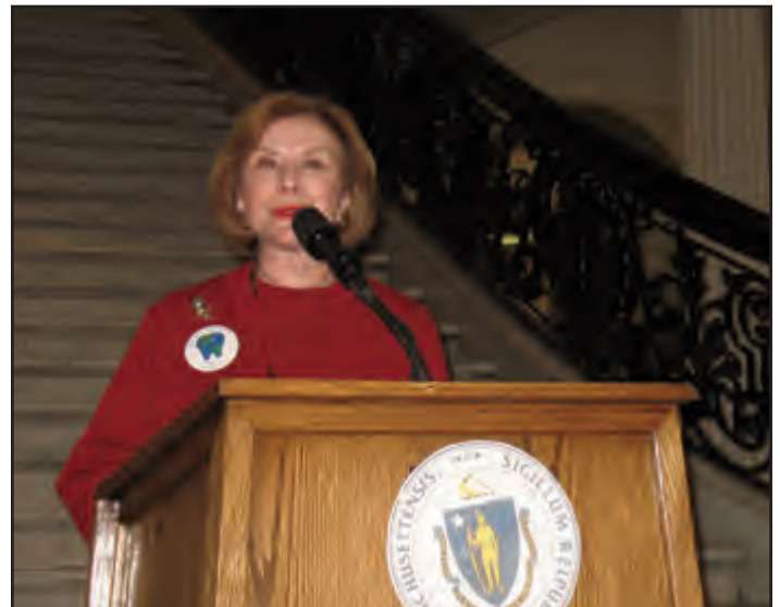
Senator Harriet Chandler